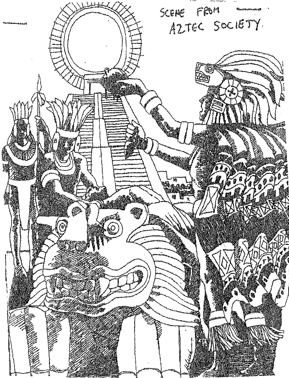
SCENE FROM _____ AZTEC SOCIETY.

Name: _____ Global History II Directions: Answer the questions that follow each drawing on separate paper. Period: _____