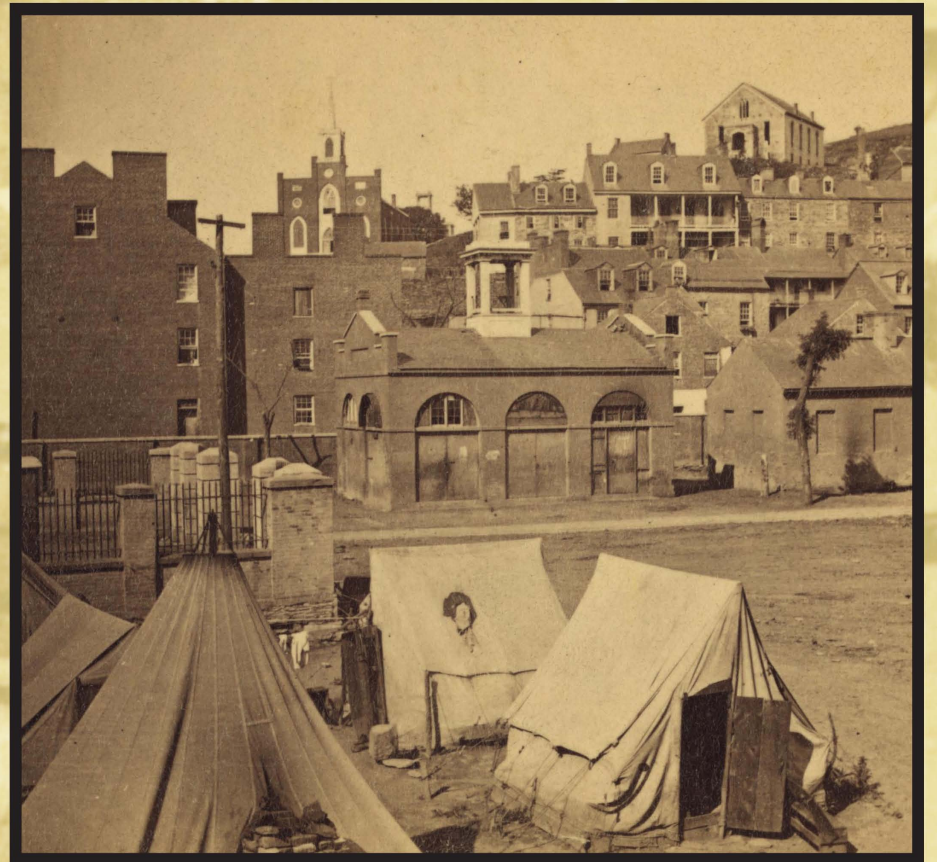
Learning of the raid, local citizens and militia soon pinned Brown and his men inside the engine house, seen in the center of this wartime photograph. The structure has subsequently come to be known as John Brown's Fort.