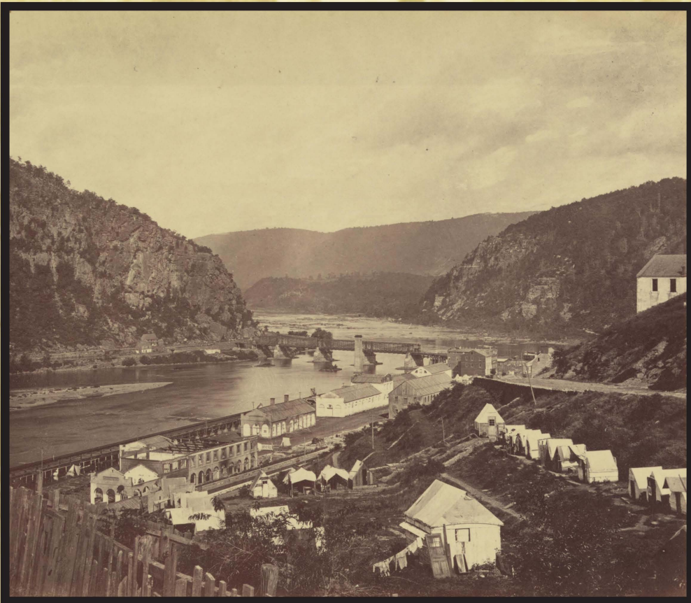
In 1801, the United States Armory and Arsenal opened at Harpers Ferry, Virginia, located at the confluence of the Shenandoah and Potomac rivers. The facility, situated in the center of this 1865 image, produced more than 600,000 muskets, rifles and pistols during the next 60 years, and became the target of John Brown's Raid in 1859.

Abolitionist John Brown supported violent action against the South to end slavery and played a major role in starting the Civil War. After the Pottawatomie Massacre, Brown returned to the North and plotted a far more threatening act. In October 1859, he and 19 supporters, armed with "Beecher's Bibles," led a raid on the federal armory and arsenal at Harpers Ferry, Virginia, in an effort to capture and confiscate the arms located there, distribute them among local slaves and begin armed insurrection. A small force of U.S. Marines, led by Col. Robert E. Lee, put down the uprising. There were casualties on both sides; seven people were killed and at least 10 more were injured before Brown and seven of his remaining men were captured. On October 27, Brown was tried for treason against the state of Virginia, convicted and hanged in Charles Town on December 2. In the five weeks before his execution, Brown entertained the press in his jail cell, turned the episode into a media circus, gained maximum publicity for his cause and further heightening regional tensions.