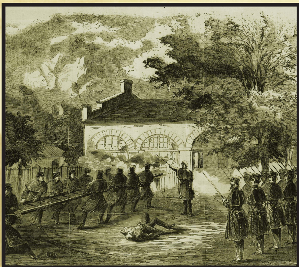
A special artist for Frank Leslie's Illustrated Newspaper made this on-the-spot illustration of U.S. Marines under the command of Col. Robert E. Lee storming the engine house on October 18, 1859. Inside they captured a wounded Brown and freed his hostages.